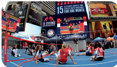
Playing the game