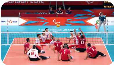
The playing area